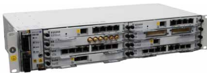
Alcatel-Lucent 1646 SM

The Alcatel-Lucent 1646 Synchronous Multiplexer (SM) and Alcatel-Lucent 1646 Synchronous Multiplexer Compact (SMC), part of the Alcatel-Lucent Optical Multi-Service Node (OMSN) family, are ideal Synchronous Digital Hierarchy (SDH) customer premises equipment (CPE) for the delivery of TDM and Ethernet services. They provide high capacity, high port density and very low power consumption while supporting high-speed Synchronous Transport Mode 16 (STM-16) rings, Fast Ethernet/Gigabit Ethernet (FE/GE) and Plesiochronous Digital Hierarchy (PDH) interfaces. The Alcatel-Lucent 1646 SM and Alcatel-Lucent 1646 SMC provide a rapid return on investment for fixed or wireless service providers and enterprises in virtually any network application.